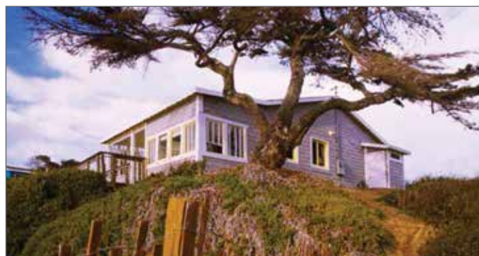
Cottage #18, The Sunset Bungalow

"Wonder at the tidepools, wait for the trumpet to signal the Martini flag, watch your grandkids fall asleep."