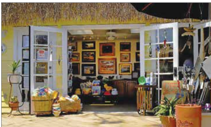
Above: Crystal Cove State Park Interpretive Store and Gallery

Crystal Cove has a long tradition of Plein Air painting, with the Cove's natural beauty and historic architecture inspiring artists for a century. Art at the Cove includes art classes for individuals and families and a robust gallery program in the Park Interpretive Store and Gallery, which showcases the work of more than 40 artists annually in the gallery, art shows and seasonal bazaars which all return essential revenue to support education programming in the park.