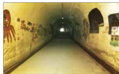
Tunnel crossing under Pacific Coast Highway into Crystal Cove State Park Historic District

The tunnel under PCH to the Historic District was originally constructed in 1932 primarily to serve as a storm drain rather than as a pedestrian walkway as it's used today. This year, the tunnel was resurfaced to route water to the sides of the tunnel and new LED lights have been added – representing a total investment of $250,000 funded by concession revenues placed in the jointly-managed Facilities Improvement Account and expended through CCA's subsidiary and State Parks concessionaire, CCBC.