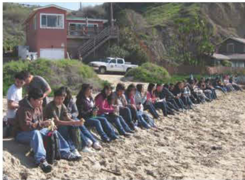
Left: New Citizen Science programs in the Park and Marine Research Facility and the Berns Environmental Study Loop are being tested this spring. Right: Brownies learn about harlequin bugs as they help test the new Bug Badge Citizen Science program at the Berns Environmental Study Loop

There are endless ways to experience Crystal Cove. CCA's recently launched website ( crystalcovealliance.org ) is a great resource for planning a day at the Park, offering a listing of programs that will please any personality and age group. Teachers and after-school leaders can also sign up to be part of the testing team for programs in development, such as the Citizen Science school programs based out of the Berns Environmental Study